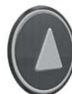
Relief marking with brushed stainless steel finish.