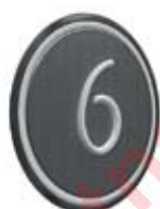
Relief marking with brushed stainless steel finish.