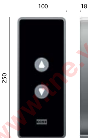
Landing call station (LCS)