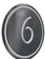
Relief marking with mirror polished stainless steel finish.

The KONE Design signalization buttons in COPs and landing devices are flush mounted. Buttons are available with an amber or white acceptance light.