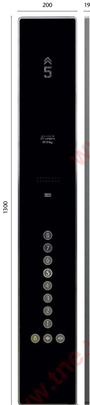
Full height KDS D40