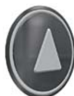
Relief marking with mirror polished stainless steel finish.